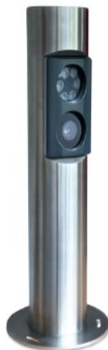
Illustration of our ANPR Entry/ Exit post